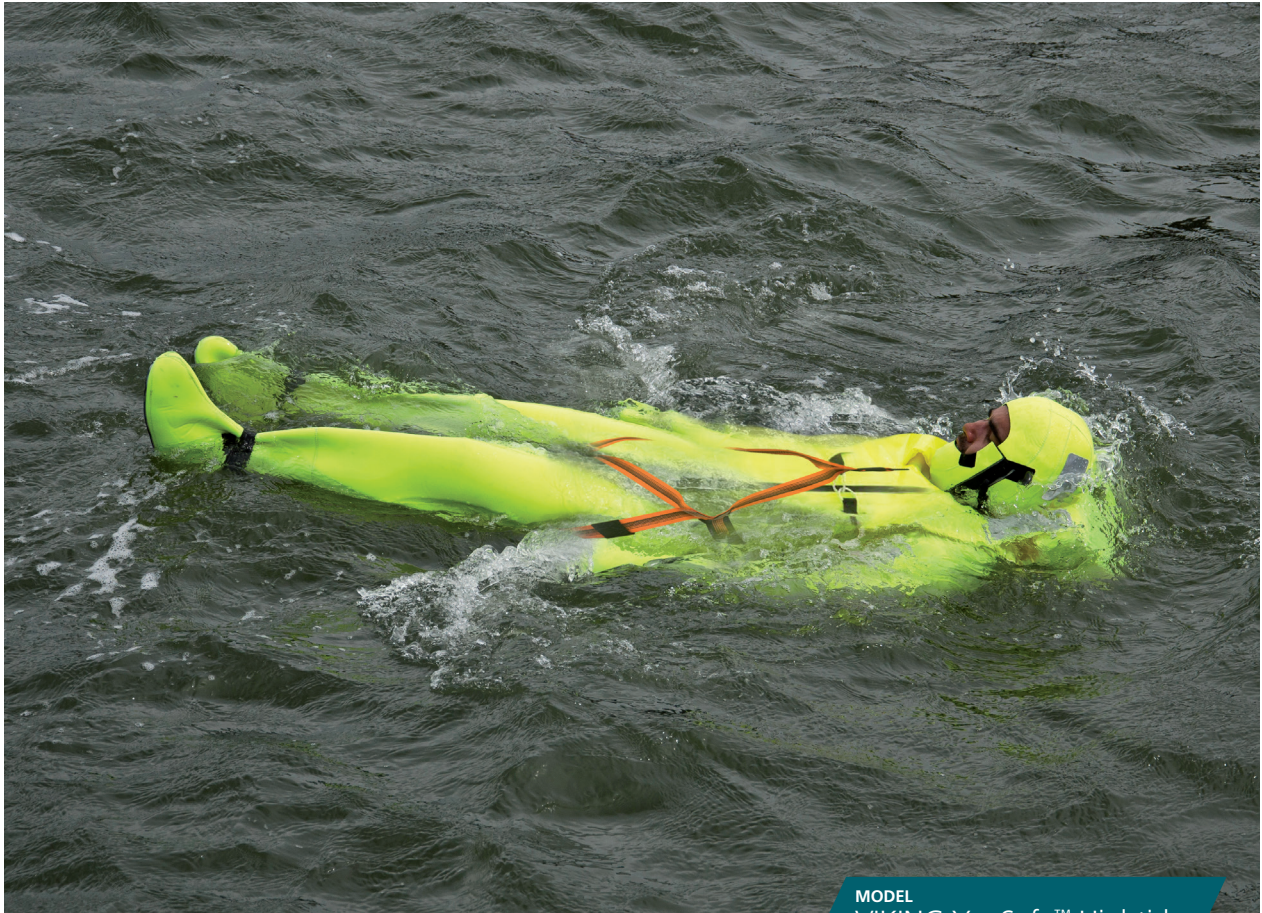
MODEL VIKING YouSafe™ Hightide