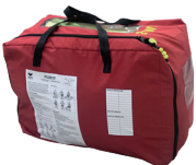
Bag with 2 suits